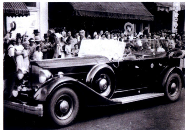
Franklin Delano Roosevelt in 1936

We are dedicated to preserving and sharing information, stories, and artifacts of Haywood County and to serving people connected to or interested in Haywood County history and genealogy.